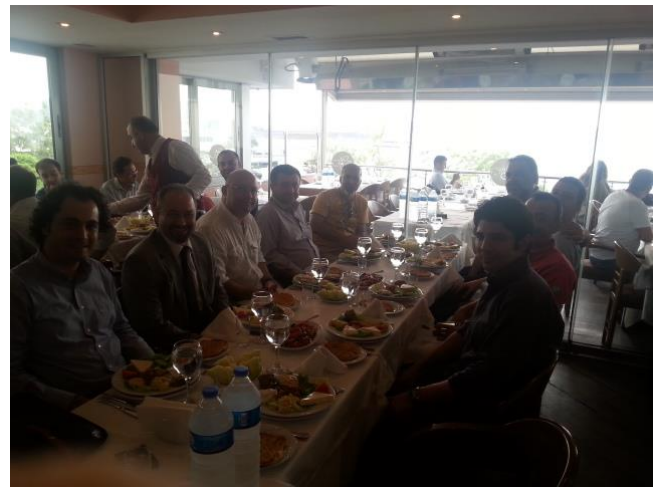
The Besiktas Shipping Annual Dinner 2014 was held in the Hanedan Restaurant ,Besiktas-Istanbul for participating shore and officers at the end of this day.